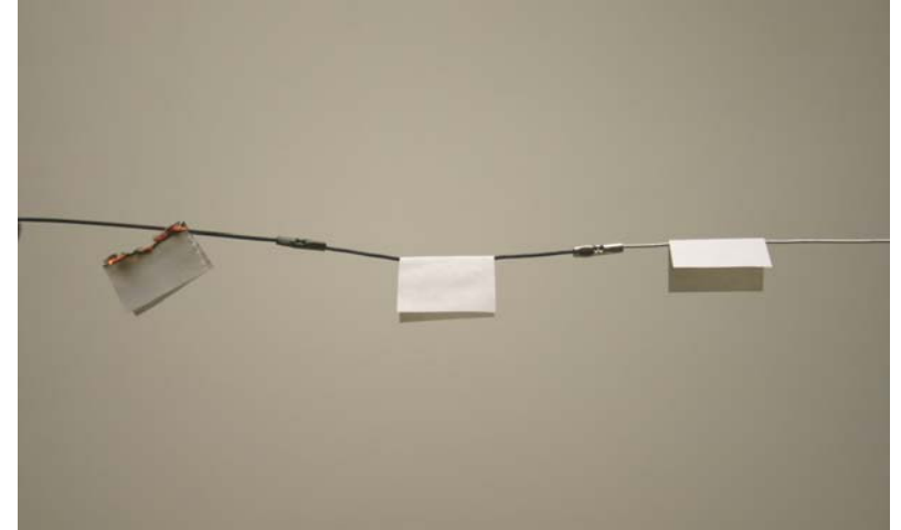
Figure 2: With the Variac output at ~90 V, the paper on the Nichrome wire (far left) burns and falls off. The paper on the steel wire (middle) and the copper wire (far right) are unchanged. (Note that the copper wire has a tin coating.)

We then turn on the Variac and increase the output voltage to approximately 80 or 90 V. With a video camera zoomed in on the wires displayed on the lecture hall screen, it is clear that the paper on the Nichrome wire begins to smoke and eventually burns through and falls from the wire to the enamel plate below. The paper on the steel and copper wires is unchanged. See figure 2.