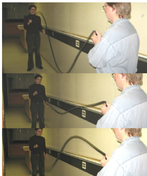
Figure 1 Demonstrating the second harmonic on a long spring.

When first introducing the idea of a standing wave, I like to dig out a long spring (at least 2 metres long) and ask a student to hold one end steady. By moving the other end in simple harmonic motion, it is a simple matter to set the spring moving in the fundamental mode (and visually, it looks very much like a giant guitar string). Using a stopwatch, students can then find the average frequency. Finding the second harmonic (shown in Figure 1) is easy enough, and it is useful to slowly increase the oscillating frequency. The erratic movement of the spring as you ramp up from f_1 to f_2 = 2f_1 is helpful in demonstrating that a string of a given length will not sustain waves at frequencies other than multiples of the fundamental. The appearance of the first node between two antinodes always elicits an 'a-ha!' reaction. And, with a bit of practice, the third and fourth harmonics can be achieved, demonstrating very readily how nodes are evenly spaced, and added one at a time as one moves through the harmonic series.